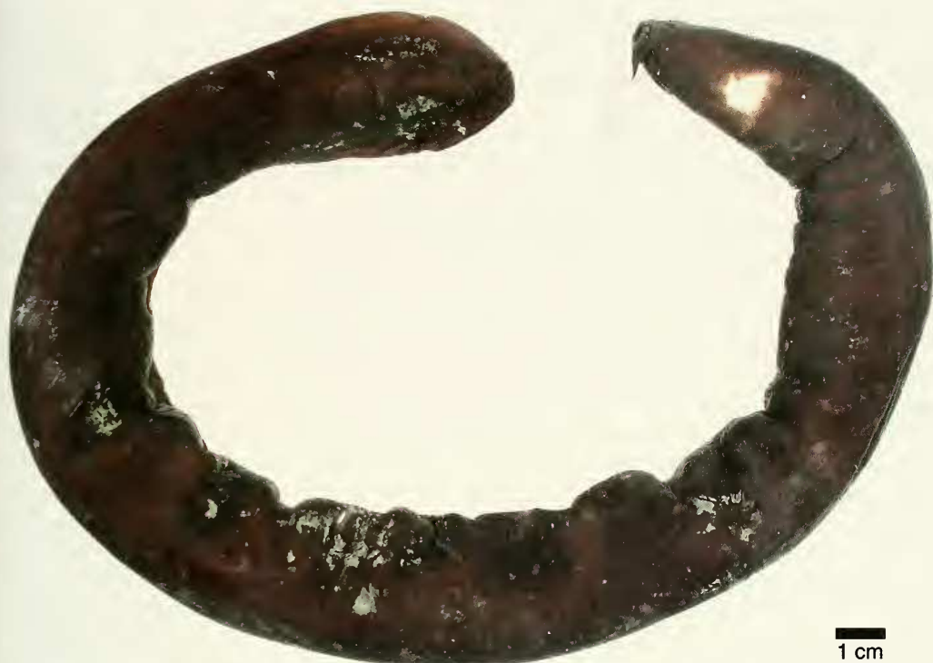
FIGURE 2. Left lateral view of preserved Eptatretus grouseri (CAS 201882; 420 mm TL).

number of unicusps on each row (6 vs. 8–10); total cusps (36 vs. 44–48); tail pores (88 vs. 71–79); shape of palatine tooth (triangular and depressed vs. conic [Fig. 3]); and its body coloration (pinkish-orange [Fig. 1] vs. dark brown [Fig. 2]). Also, the teeth of E. lakeside are more slender and more elongate than those of E. grouseri (Fig. 3). Eptatretus lakeside differs from E. profundus in the following characters, respectively (based on the redescription of the holotype of E. profundus